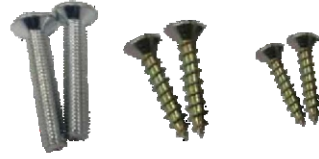
SCREW M4×25 (Panel) ST3.5×16(Lock case) ST3.5×20(Striking Plate)