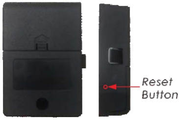
LOCK CASE Material:ABS Size: 60×86×23.5mm