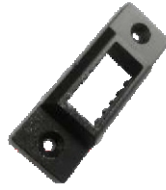
STRIKING PLATE Material:ABS Size: 73.3X24.2X12MM